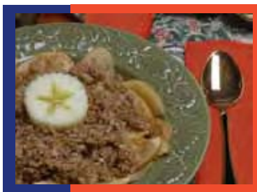
Learn to cook delicious food

Absolutely - and we mean to prove it. People haven't been taught how to cook healthy and can have trouble following or finding tasty recipes. So we started this cooking school.